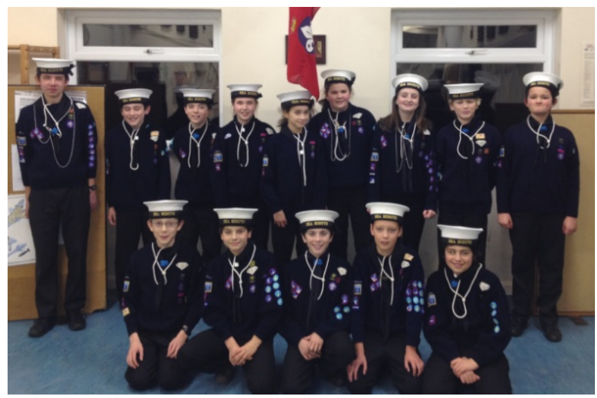
The Night Hike teams