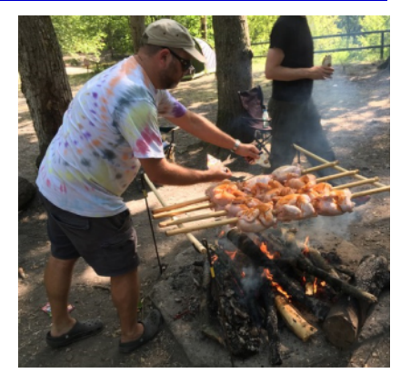
To finish off the camp, on the last day everyone went to the beach at Boscombe, a great day of sea swimming and beach games.

We luckily did not get the really extreme heat, just a few isolated showers and a spectacular lightning display one night to liven things up.