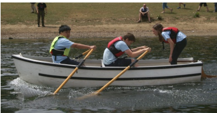
Under 14 double dinghy, 3rd place