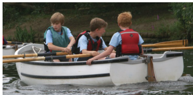
Under 12½ double dinghy