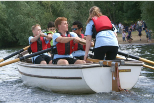
Under 18 gig crew