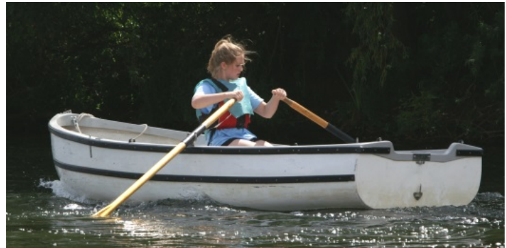
Iona, under 16 dinghy, 3rd place