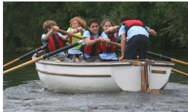
Under 16 gig crew