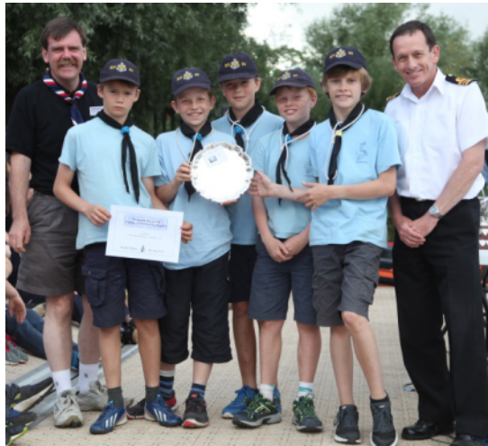
Winning under 12½ gig crew and winners of under 12½ overall