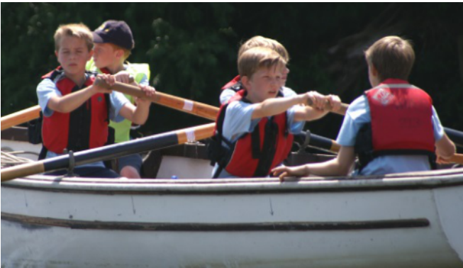
Winning under 12½ gig crew