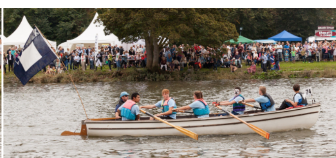
Explorers (a seriously competitive crew)