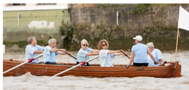
Guild (record-breaking time, despite taking on all that water...)