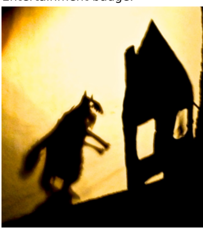
The puppets were superb and the adaptations of the stories brilliant...and quite gruesome!

The Pack staged a Shadow Puppet competition for their Entertainment badge.