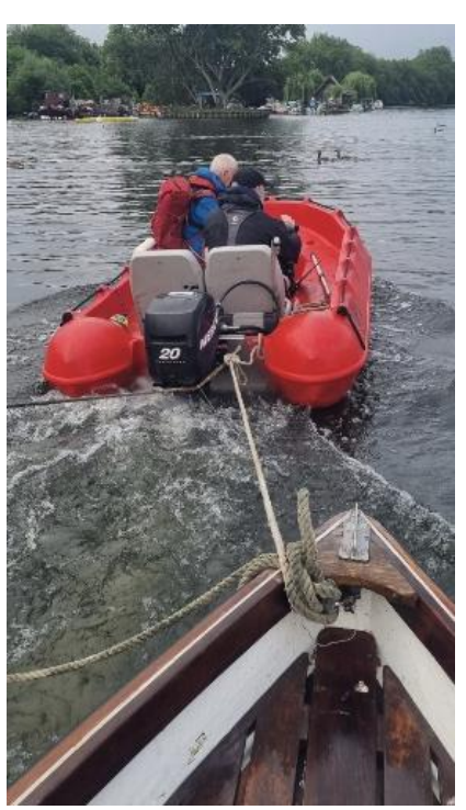
Our dynamic duo heading upstream!