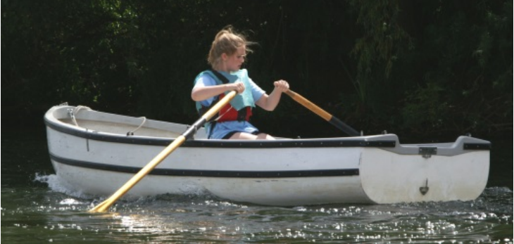
Iona, under 16 dinghy, 3rd place