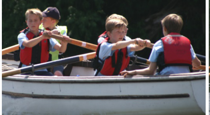
Winning under 121/2 gig crew