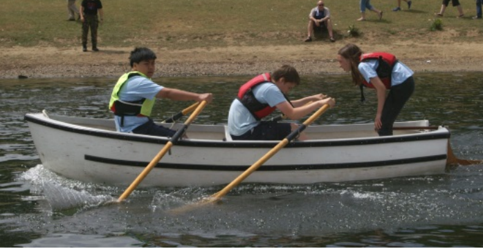
Under 14 double dinghy, 3rd place