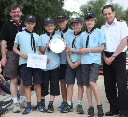
Winning under 12½ gig crew and winners of under 12½ overall